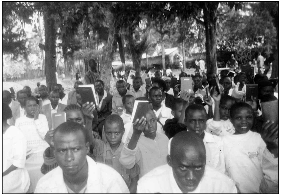
Kenya Converts receiving Bibles from ICLD

Greetings in the name of Jesus. I am serving the Lord, Orphans and Widows. Church planting in the unreached area where my 60 co-workers and I have so far planted 200 churches among the primitive people where human sacrifice is still in practice. We have 3 orphanages caring for about 100 children. We are facing persecution sometimes but God is blessing our ministry. We support 40 pastors and 25 lady pastors, by Faith. We need your prayers.